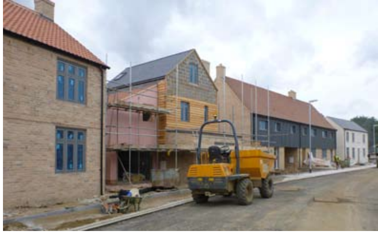
CLT homes during the build phase at Manor Farm, Stretham

The Community Land Trust movement is continuing to gain traction nationwide; there are now over 225 CLTs in England and Wales. East Cambs remains a key driver in this growth and is developing a successful model which allows local people to take back control over their neighbourhoods and tackle the housing crisis head-on.